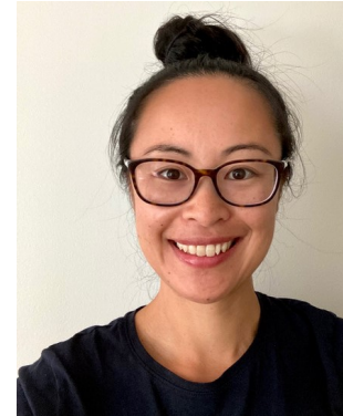
Religious Education teacher at Hornsby Girls' High School.